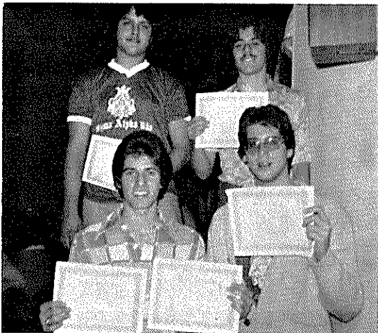
Brother of the Month Winners